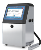
Continuous Inkjet Printer

*Please consult EC-JET for more information