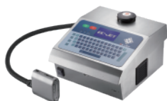
Large Character Inkjet Printer